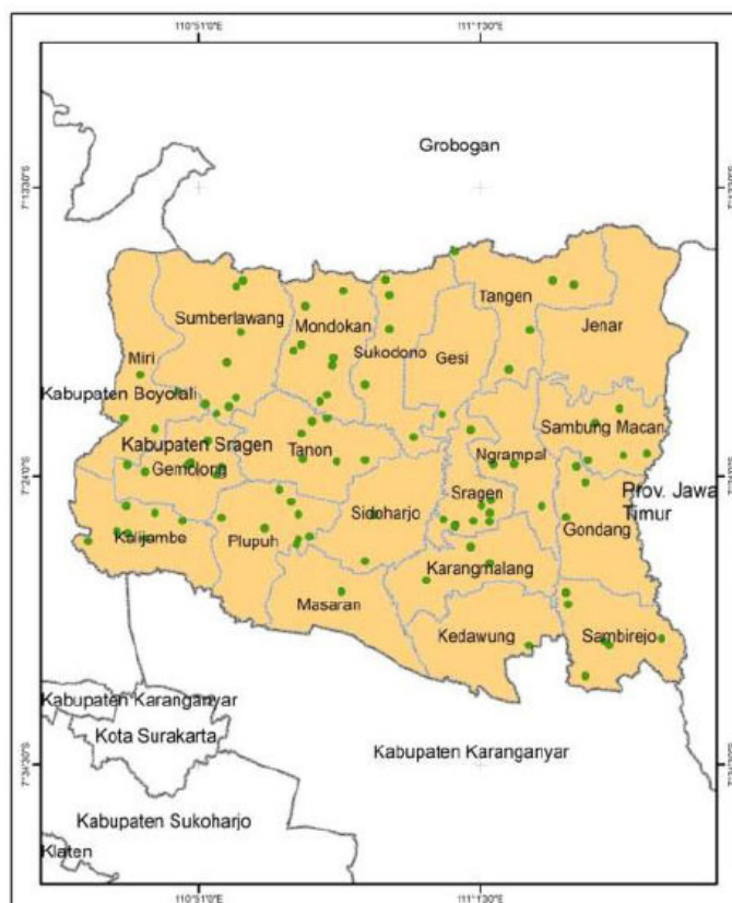
Figure 4. Spatial distribution of dengue hemorrhagic fever case in sragen regencies 2019.

has the highest case distribution after Sumberlawang is Gemolong and Plupuh district, the three sub-districts are situated in different areas close together. Based on the analysis of the quantum GIS software, the distribution pattern. The incidence of DHF in the Sragen regency is clustered and DDisperse/spread. In Sragen Regency, those 3 clusters are in Sumberlawang, Gemolong, and Miri districts, the second is Tanon, Mondokan, and Sukodono, the third is Sragen, Karangmalang, and Ngrampal