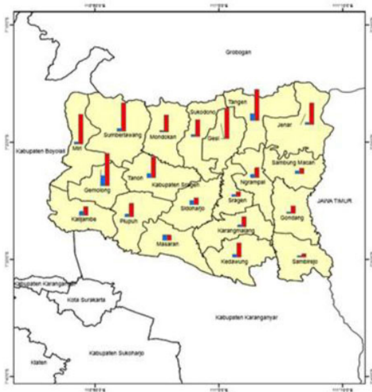
Figure 3. Gender distribution of dengue hemorrhagic fever case in sragen regency 2018.