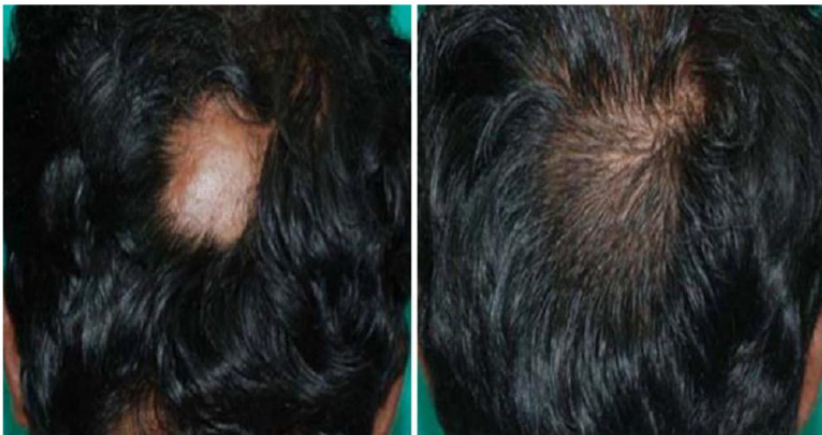
Figure 2. Alopecia areata on a 24-year-old man, before and after 3 months of PRP 6

Alopecia areata is a form of autoimmune hair loss without scarring, which affects the scalp with or without affecting the body. Treatment of AA based on the underlying disease. PRP therapy was introduced as an adjuvant therapy modality in AA, especially chronic alopecia areata. This therapy is easy to do and effective in AA, without side effects, and might offer useful therapies in AA. Although several studies have shown the efficacy of PRP therapy in AA, further randomized clinical trials need to be done to support the efficacy of this therapy. Concentration standards and preparation methods of PRP are also needed in order to produce a homogeneous PRP product.